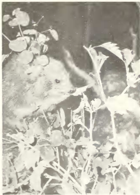
Plate Ib An animal eating a leaf which remains projecting out of the side of the mouth. The peculiar form of the feet can also be seen.